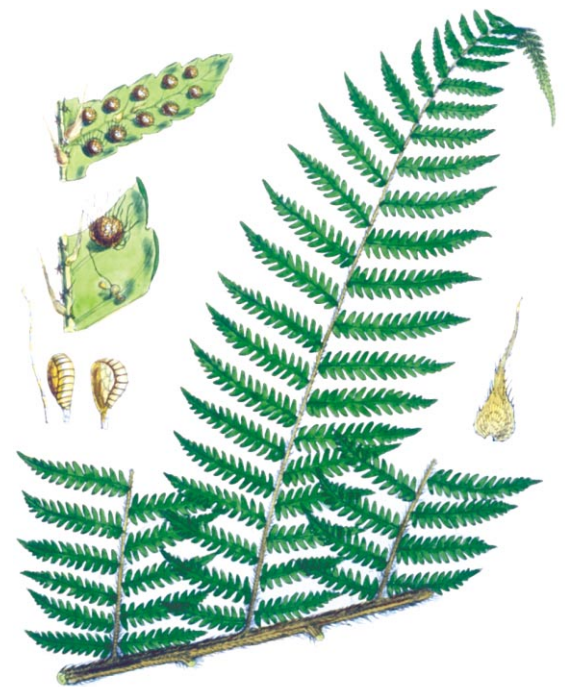
Figure 5 Alsophila colensoi , one of the many species of New Zealand plants that Hooker named after William Colenso. Colour plate from Hooker, J.D. (1855) Flora Novae-Zelandiae ( Botany of the Antarctic voyage: volume 2 ), Lovell Reeve.

Hooker dealt with Colenso's botanical ambitions by giving in as much as he could while ignoring the New Zealander's desire to name plants. Hooker helped Colenso to join several of London's prestigious scientific societies, such as the Royal and Linnean Societies. As in Gunn's case, Hooker's numerous, affable letters were accompanied by gifts of microscopes, books and personal photographs. And, although Hooker would not allow Colenso the right to name plants, he did name several species after his New Zealand correspondent (Figure 5).