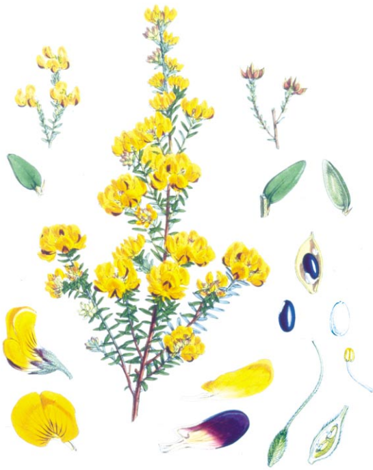
Figure 4 Pultenaea Gunnii , one of the numerous Tasmanian plants which Hooker named after Gunn. Colour plate from the Flora Tasmaniae (Ref. 5). Reproduced by permission of the Syndics of Cambridge University Library.