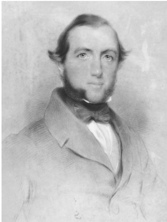
Figure 2 Ronald Campbell Gunn.