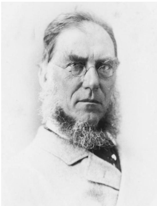
Figure 6 Joseph Dalton Hooker in 1869, just after he became director of Kew. This carte de visite , signed by Hooker, was a gift to R.C. Gunn.

The importance of the colonial collectors to Hooker can be gauged by that fact that he dedicated the Flora Novae-Zelandiae (1855) to Colenso and the Flora Tasmaniae (1859) to Gunn. In both cases, the honour was shared with other colonial collectors, but the men Hooker thanked were only the most prominent members of his networks: there were dozens of others, including several colonial women, whose names and contributions are largely forgotten.